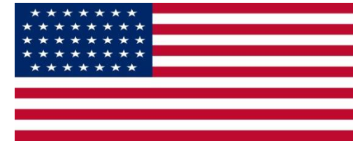
US Flag during 1889

Flag Day is a celebration of our nations flag, it is believed to have begun by a school teacher in New York City on June 14, 1889. This date was later adopted by the State Board of Education of New York. Over the following years it grew in popularity by school children and adults, too, who participated in patriotic programs. Franklin K. Lane, Secretary of the Interior, delivered a 1914 Flag Day address in which he repeated words he said the flag had spoken to him that morning: "I am what you make me; nothing more. I swing before your eyes as a bright gleam of color, a symbol of yourself."